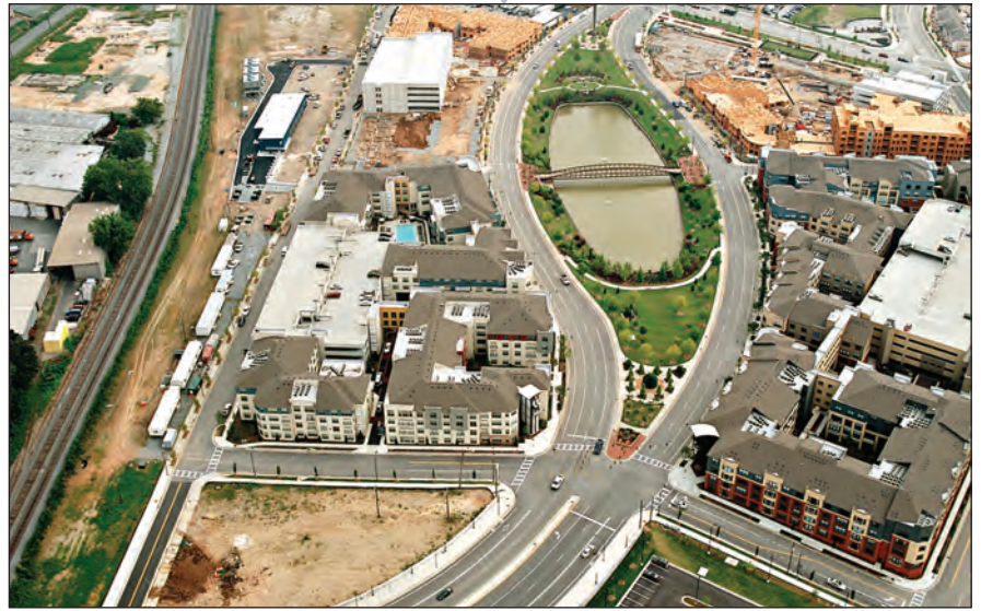
The Commons area of Atlantic Station features a 2-acre lake and a park that will include an amphitheater for small outdoor concerts. Apartments, townhomes and condominiums will surround the park area.

Publix is opening an urban prototype store at Atlantic Station; it will cater to people who will stop in daily for lunch and those who will shop for